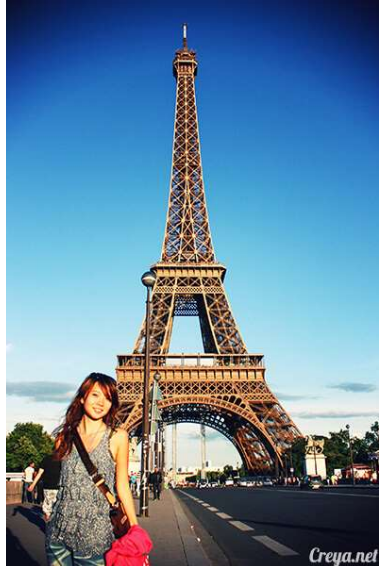
看我的歐行腿 | 艾菲爾鐵塔, 2016