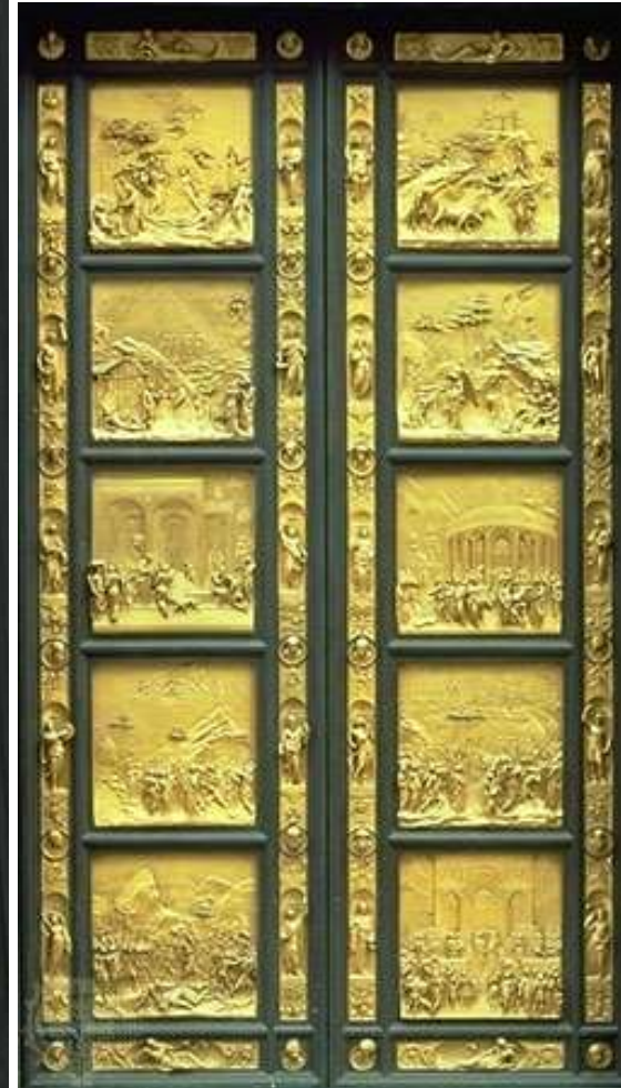
天堂之門 主教座堂博物館 ( Museo dell'Opera del Duomo )