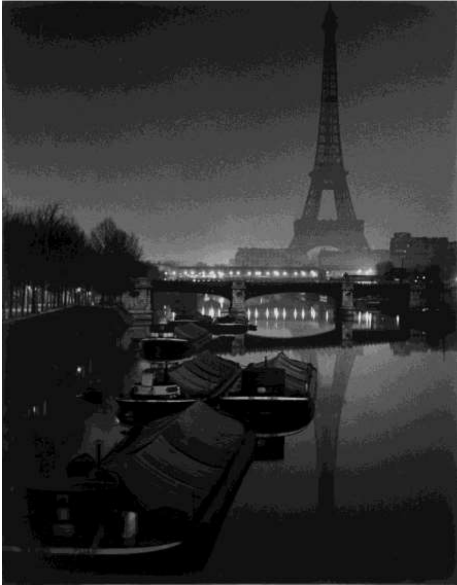
The Eiffel Tower at Twilight by Brassai, 1932